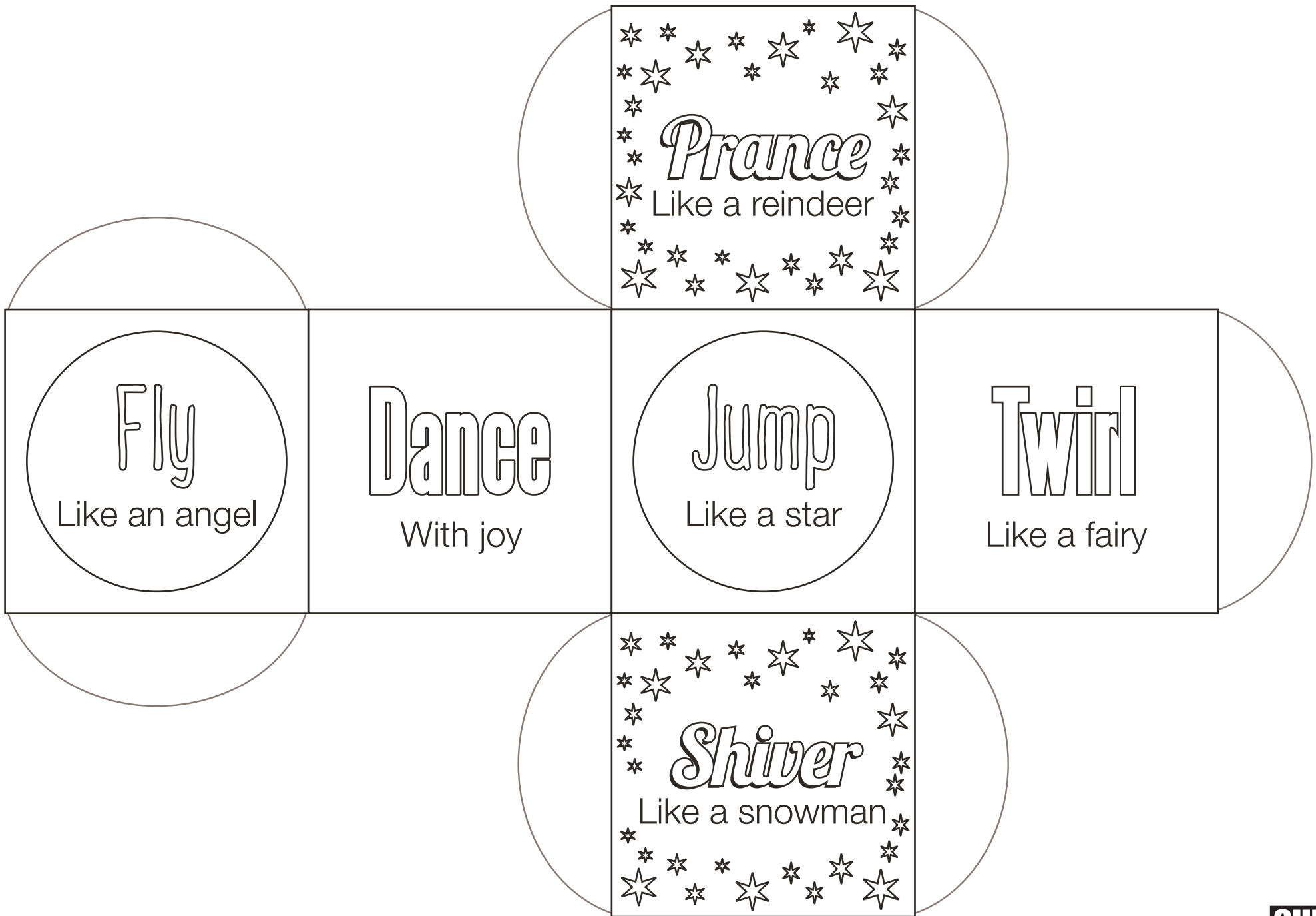
Christmas noise and action dice