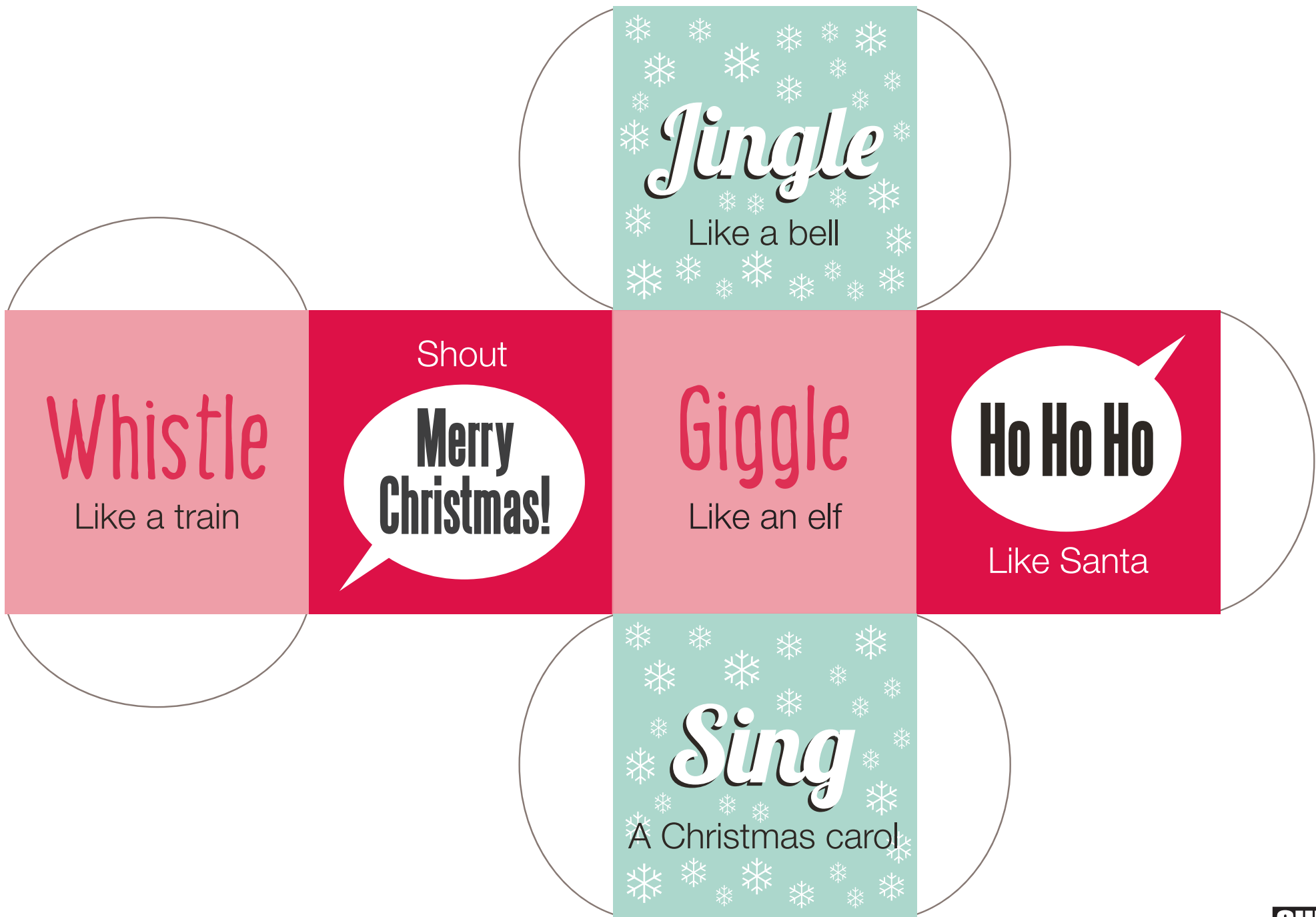
Christmas noise and action dice