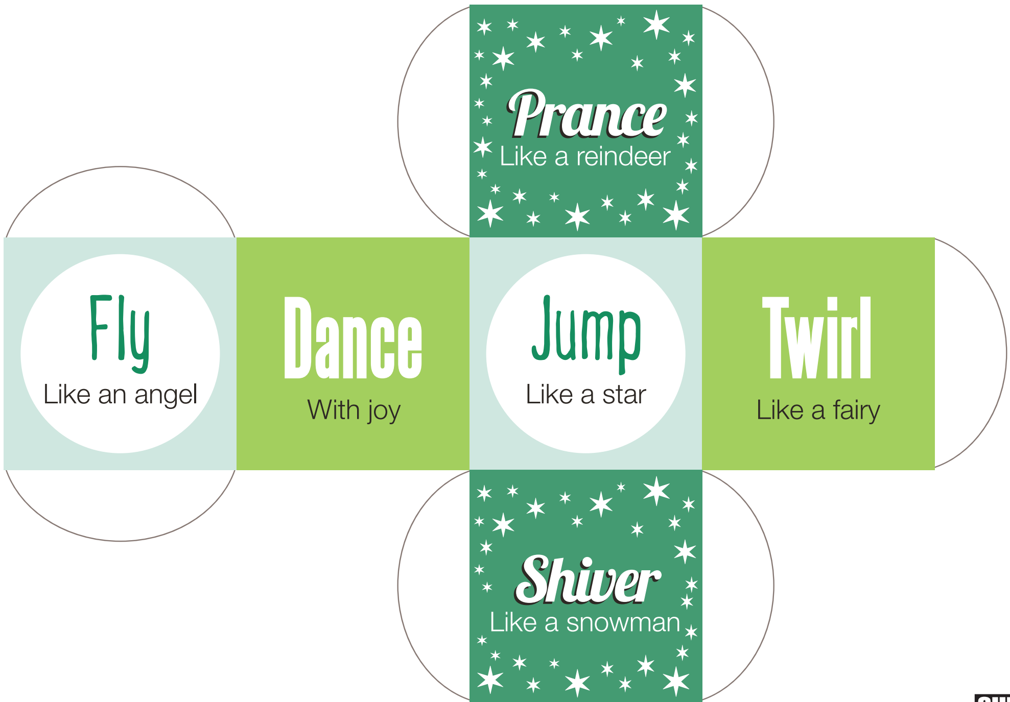
Christmas noise and action dice